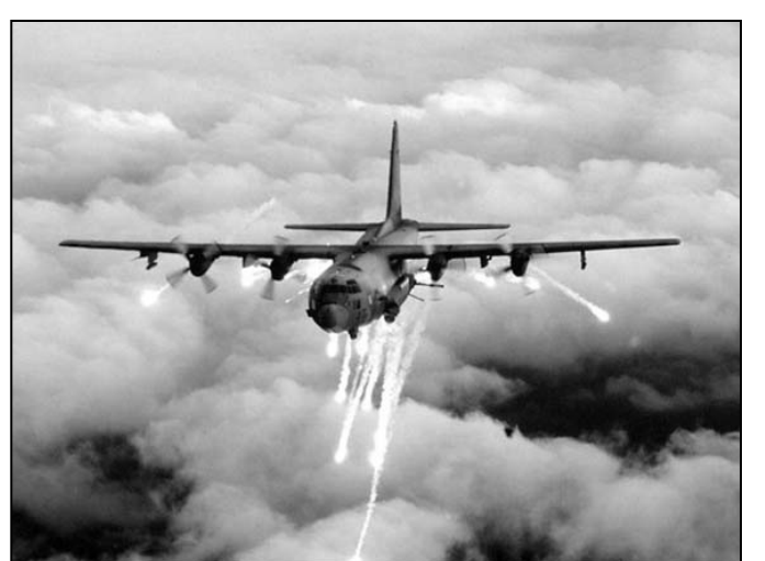
Air Force AC-130 gunships struck al Qaeda targets in Somalia on January 8, 2007, according to news reports. The reports said the AC-130 attacks hit an area called Ras Kamboni, a heavily forested area near the Kenyan border.

AFRICOM. Operation Enduring Freedom Trans Sahara (OEF-TS) provides military support to the Trans-Sahara Counter Terrorism Partnership (TSCTP) program, which comprises the United States and eleven African countries: Algeria, Burkina Faso, Libya, Morocco, Tunisia, Chad, Mali, Mauritania, Niger, Nigeria, and Senegal. Its goals are defined on the AFRICOM web site as "to assist traditionally moderate Muslim governments