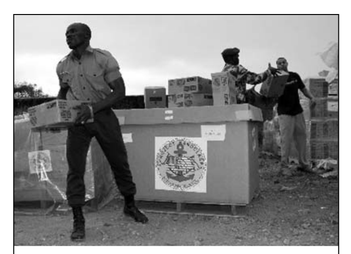
AFRICOM releases a steady stream of photographs and stories highlighting community relations and similar projects. In this picture, a Ghanaian, Cameroonian and U.S. sailor load donated Project Handclasp materials for a community relations project in Sekondi, Ghana, as part of an Africa Partnership Station (APS) initiative, February 26, 2009.